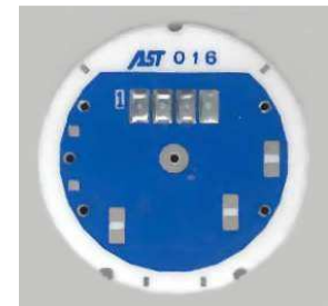
- Scale 1/1 -

All applications All aggressive media (★)